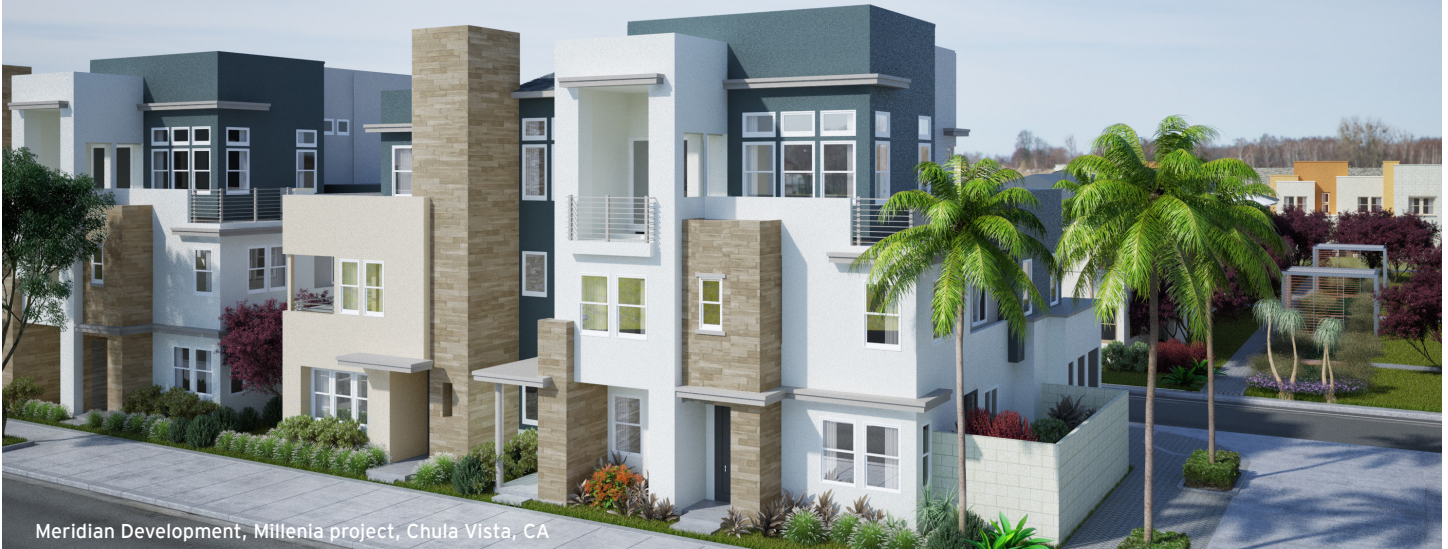
Meridian Development, Millenia project, Chula Vista, CA

Duane Morris represents a wide range of land developers and property owners in multiple jurisdictions at the local, state and federal levels. Our real estate development and land use attorneys have extensive experience with site assemblage and acquisition, planning, zoning, subdivisions, use permits, environmental issues and construction contracts. The laws, procedures and requirements for development projects necessarily vary by jurisdiction. Leveraging the firm's expansive geographic reach, Duane Morris real estate and land development attorneys in offices throughout the U.S. provide legal counsel, guidance and advice specific to the issues and needs of that region—from negotiating transfers of air rights in New York to redeveloping federal building sites in Washington, D.C., and from rewriting local zoning ordinances in Pennsylvania to guiding projects through the maze of environmental, water supply and coastal zone laws in California.